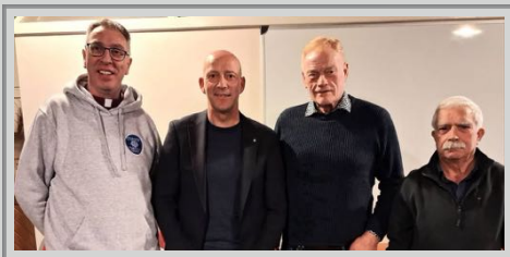
At Longford Historical Society Lecture

One of our mission goals is to have a greater presence in our communities, and be recognised as an open, accessible, caring faith group. Having our service in February broadcast nationally, and beyond was certainly one way to be noticed, and we pray God continues to bless through that. We are beginning to see other opportunities to increase our presence beyond our buildings and into our communities. Corboy Historical Society held a lecture